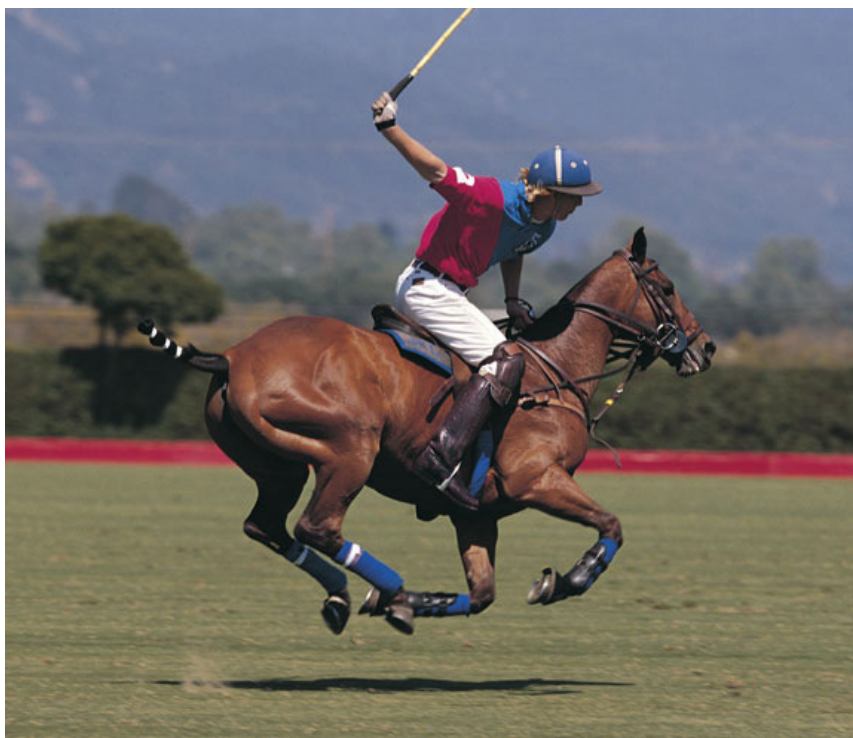
Polo Originated in Persia around the 5th Century. Military Officers imported the game to Britain in the 1860's. Polo is now an active sport in 77 countries.

CTRA wishes to thank all of our attendees, donators, volunteers, and sponsors for their efforts in making our annual Dinner Auction Gala a continued success. This year, the event raised approximately 20,000 for the program. Way to go everyone!